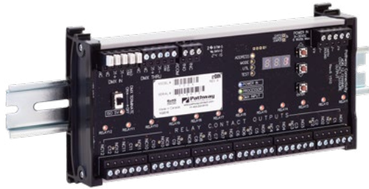
Model shown: PWINF DIN CC